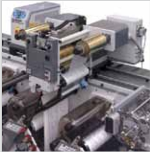
HOT FOIL UNIT ON RAIL