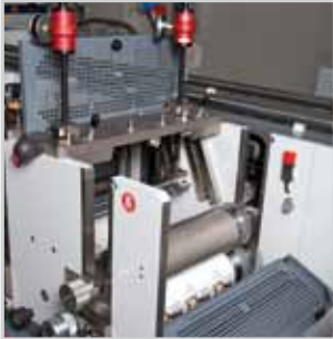
HIGH-PERFORMANCE DIE-CUTTING STATION