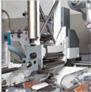
WEB TURN BAR